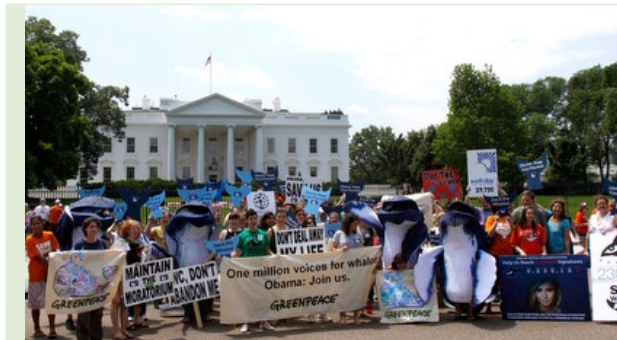
Activists deliver over a million messages to the White House on Thursday, June 3rd.